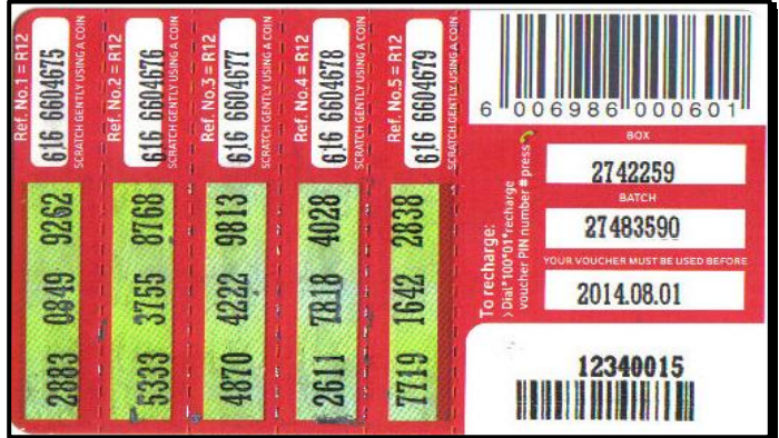
Issued: Oct - 2011. TAT 167 Pg 10 (BBC: 20mm x 5mm)