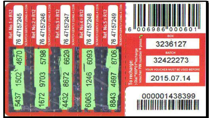
Issued: Sep - 2014. TAT 200 Insert Pg 21