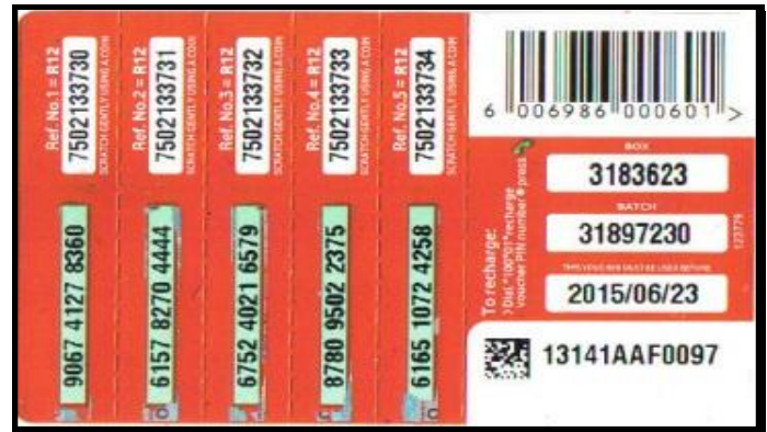
Issued: Sep - 2014. TAT 198 Pg 20