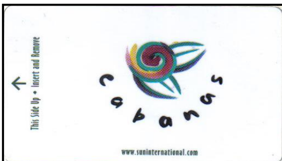
Sun Int. The Cabanas - DK - 1 - Front