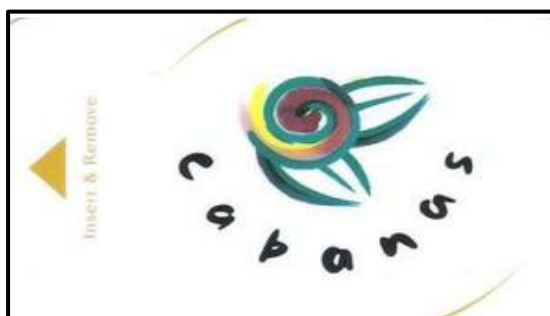
Sun Int. The Cabanas - DK - 2 - Front