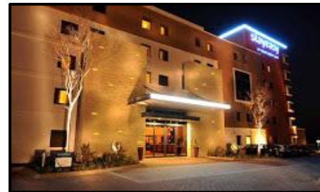
StayEasy - Emalahleni

Conveniently located off the N4 highway between Mpumalanga and Gauteng. StayEasy Emalahleni offers affordable, comfortable accommodation in the town of Emalahleni (previously Witbank). Located on the premises of the Ridge Casino and Entertainment Centre adjacent to the Highveld Mall, guests can enjoy the many restaurants or entertainment activities on offer. The hotel sports a new look for StayEasy, having been designed and built with environmentally conscious principles at heart. StayEasy Emalahleni boasts understated style and is the perfect practical solution to your accommodation requirements.