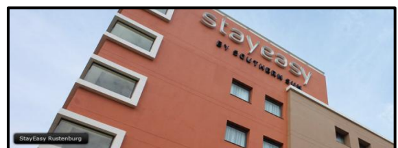
StayEasy - Rustenburg