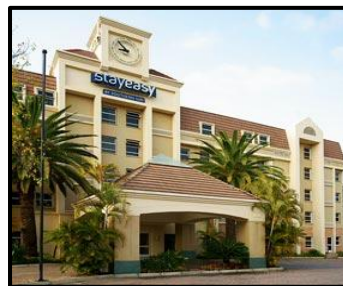
StayEasy - Emnotweni

StayEasy Emnotweni is located in Nelspruit, and offers easy access to some of Mpumalanga's most spectacular tourist attractions, including the Kruger National Park, Pilgrim's Rest, Emnotweni Casino Resort and other breathtaking destinations.