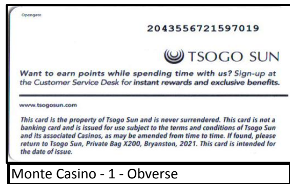
Monte Casino - 1 - Obverse