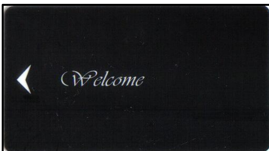
Colloseum Hotel - DK 1 - Front