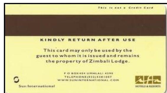
Zimbali Lodge - DK 1 - Obverse