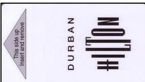
The Hilton Hotel - Dbn - DK 2 - Front