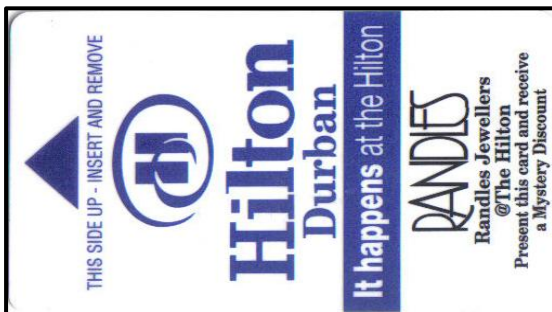
The Hilton Hotel - Dbn - DK 1 - Front