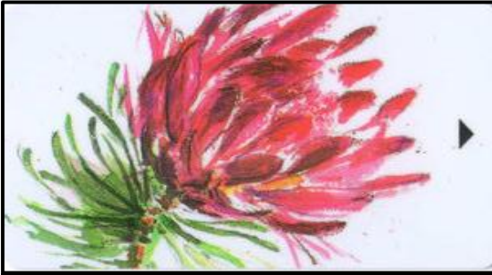
Mount Nelson Hotel - DK 2 - Front