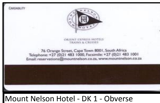
Mount Nelson Hotel - DK 1 - Obverse