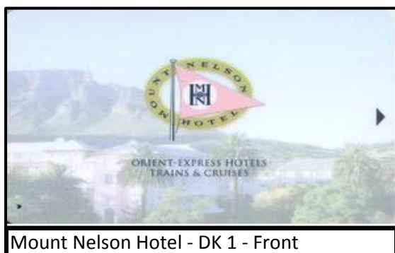
Mount Nelson Hotel - DK 1 - Front