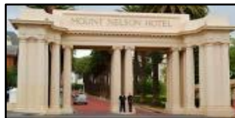
The Mount Nelson Hotel in Cape Town