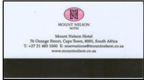
Mount Nelson Hotel - DK 2 - Obverse