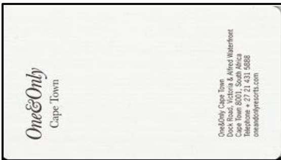
One & Only Hotel - DK 1 - Front