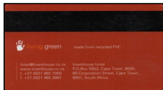
Townhouse Hotel - DK 1 - Obverse