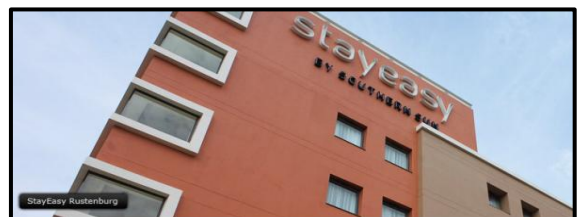
StayEasy - Rustenburg