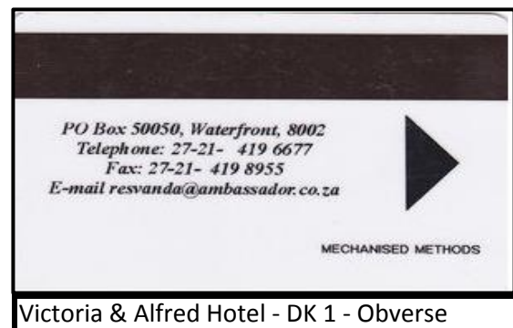
Victoria & Alfred Hotel - DK 1 - Obverse