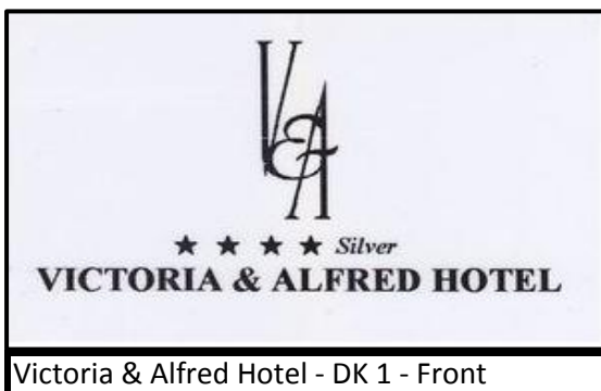
Victoria & Alfred Hotel - DK 1 - Front