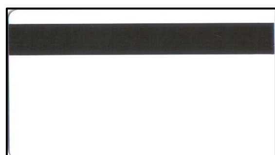
Vineyard Hotel - DK 2 - Obverse