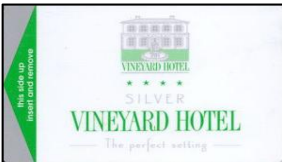
Vineyard Hotel - DK 1 - Front